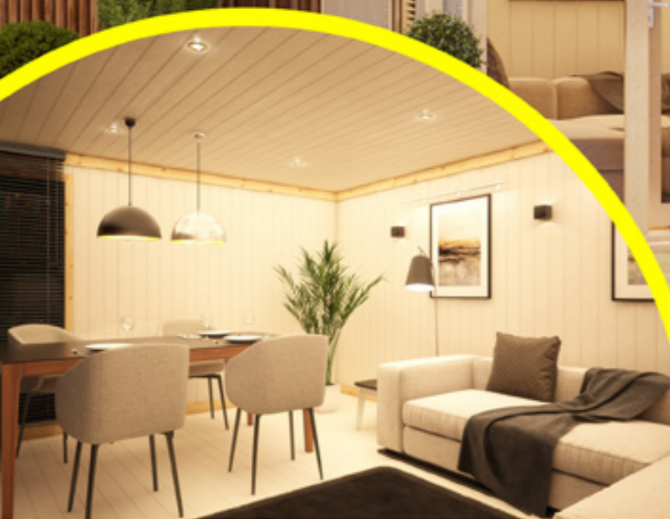
OFFSET DOOR INSULATED GARDEN ROOM