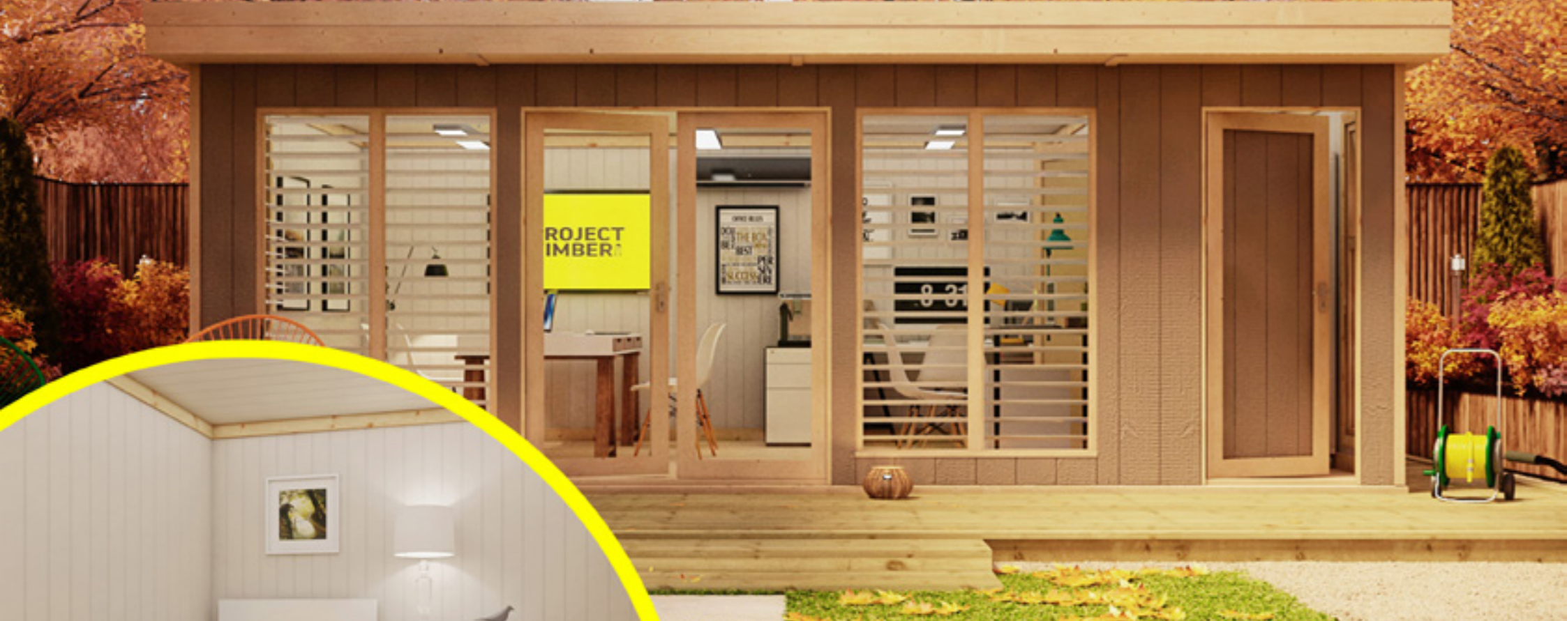
INSULATED GARDEN ROOM WITH PARTITION WALL