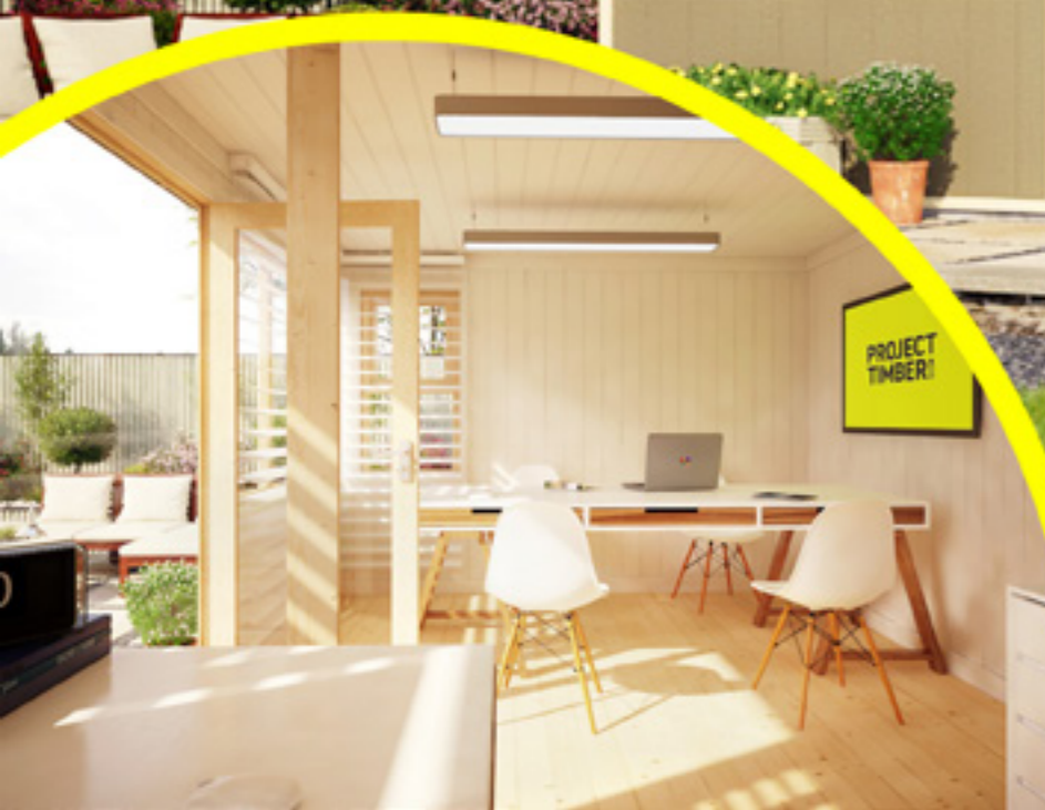
HIGH WINDOW INSULATED GARDEN ROOM