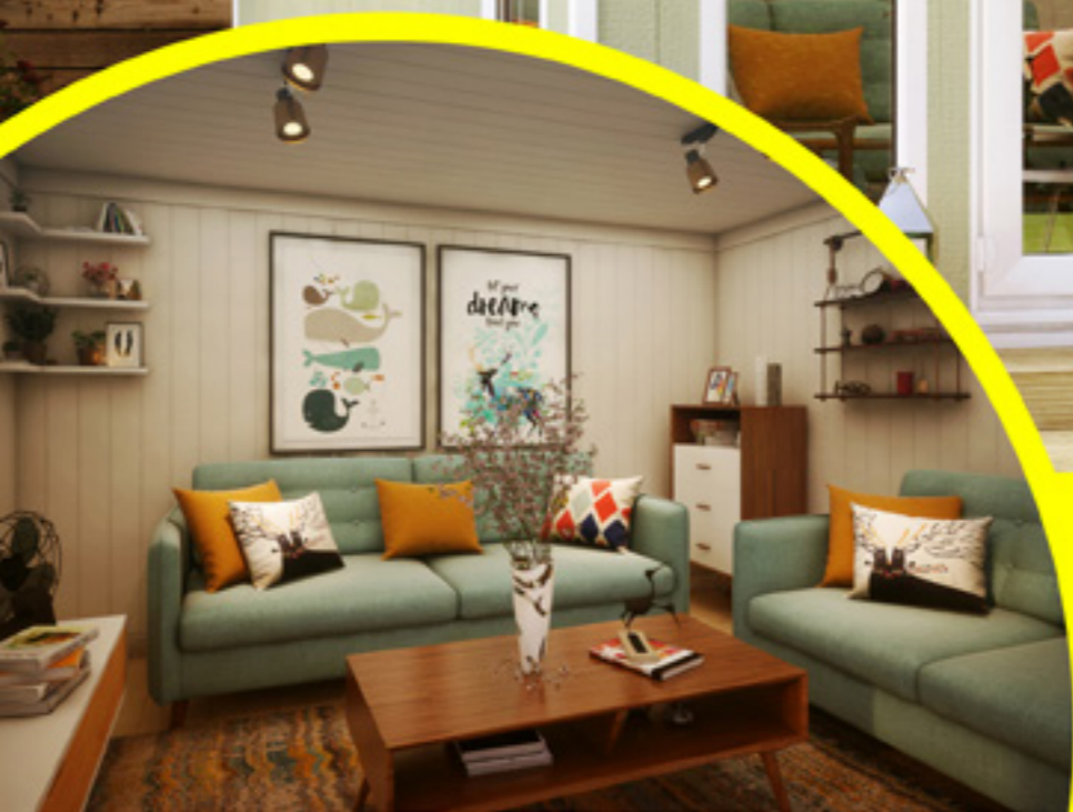
LARGE OVERHANG INSULATED GARDEN ROOM