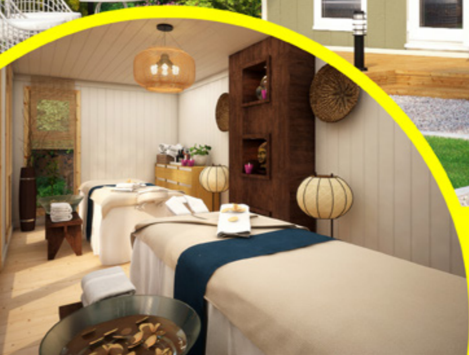
EVOLUTION GARDEN POD