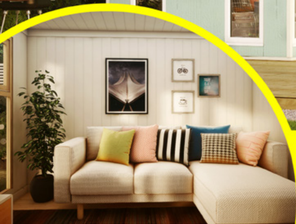
GARDEN ROOM WITH SIDE CANOPY