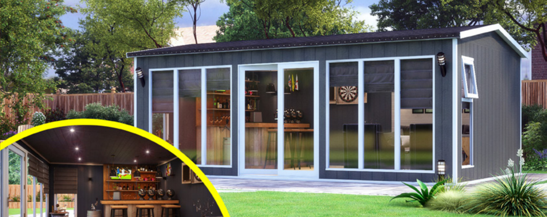
EVOLUTION APEX GARDEN ROOM