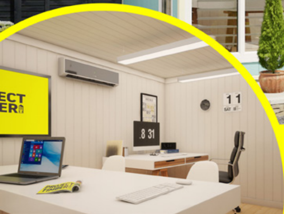
INSULATED GARDEN ROOM